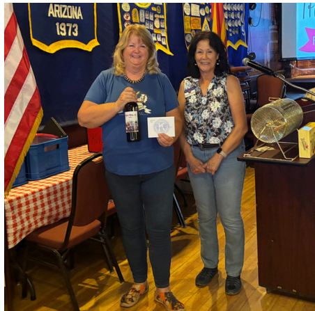
TENDER LITTLE HEARTS MINI TALES April 23