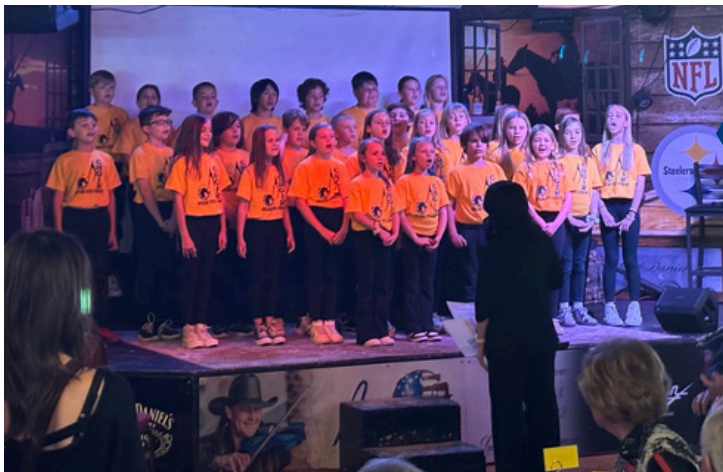
Horseshoe Elementary choir sang Patriotic songs during our luncheon.