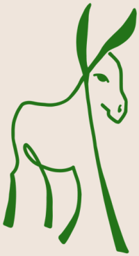
THE DONKEYS OF THE HEART

Thanks to a generous grant from the Kiwanis Club of Carefree, we will be able to make several important improvements at the sanctuary. This includes the installation of a much-needed roof for the donkeys, as well as the purchase of two saddles — one for Alfred and one for Felix. Each donkey will now have their own custom-fitted saddle for their comfort and well-being. Additionally, we will be investing in new instructional aides for our sessions, enhancing the educational and interactive experience for our participants.