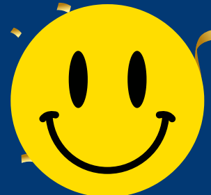
JIM RIEDL $118

50/50 WINNERS YOU MUST BE PRESENT TO WIN