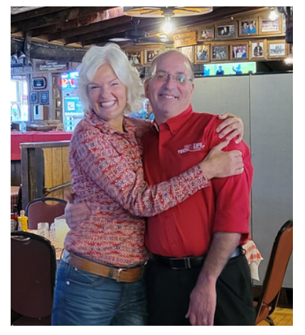
Well, almost all smiles