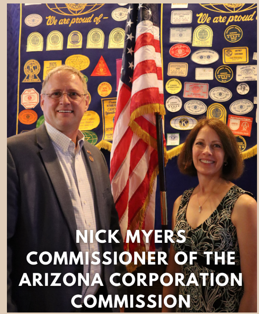
NICK MYERS COMMISSIONER OF THE ARIZONA CORPORATION COMMISSION